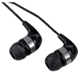
art. no 38-2485 Exibel