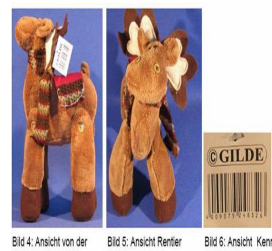
Bild 4: Ansicht von der Seite Rentier (mittel) Bild 5: Ansicht Rentier (mittel) von vorne Bild 6: Ansicht Kennzeichnung