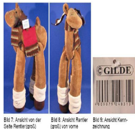
Bild 7: Ansicht von der Seite Rentier (groß) Bild 8: Ansicht Rentier (groß) von vorne Bild 9: Ansicht Kennzeichnung