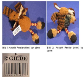
Bild 1: Ansicht Rentier (klein) von oben Bild 2: Ansicht Rentier (klein) von vorne Bild 3: Ansicht Kennzeichnung