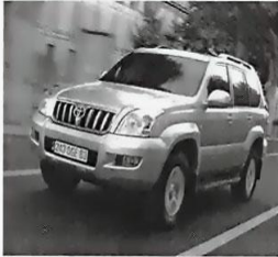
Toyota Land Cruiser 120